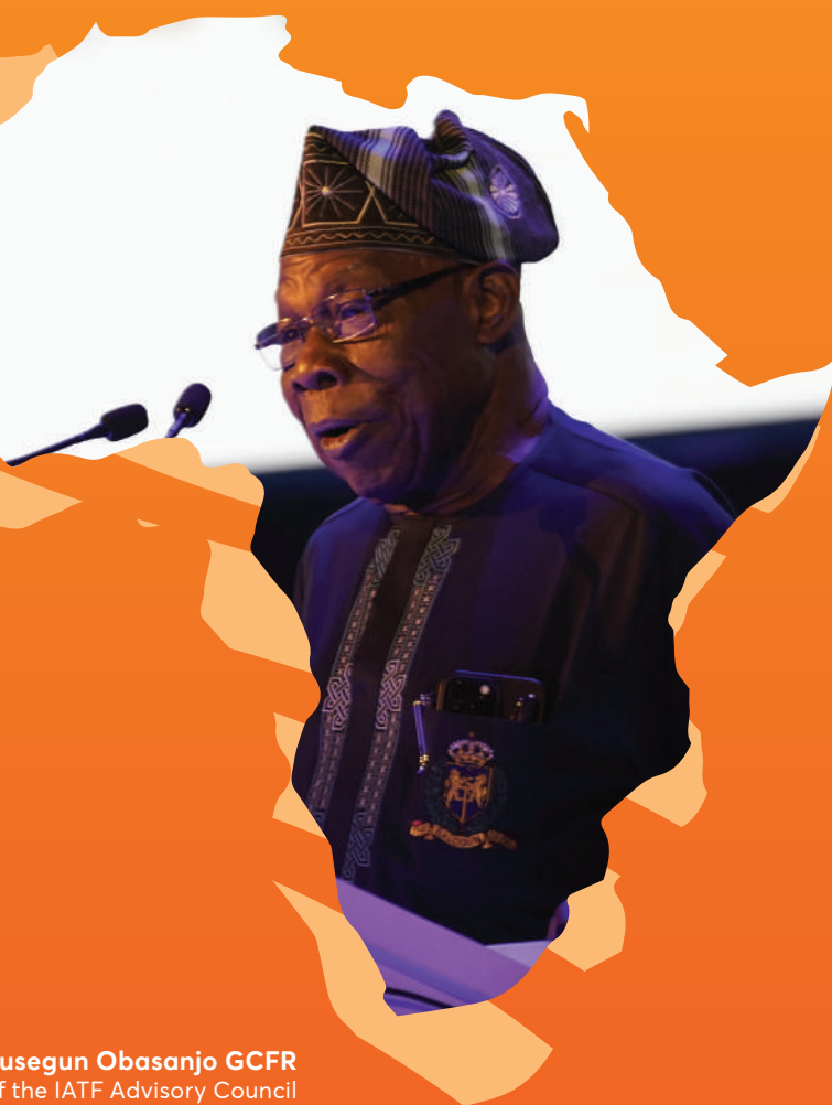
H.E. Chief Olusegun Obasanjo GCFR Chairman of the IATF Advisory Council and Former President of Nigeria

IATF2025 will provide a unique and valuable platform for businesses to access a single African market of over 1.4 billion people with a GDP of over US$3.5 trillion created under the African Continental Free Trade Area.